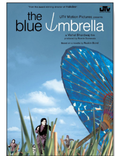
The Blue Umbrella