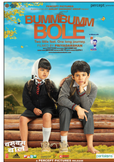
Bumm Bumm Bole